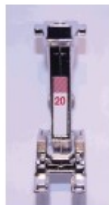
Open Toed Applique Foot

Check the Supply List on the pattern and bring those items to class. You will need to provide your own fabric, and light-weight cotton batting. Amounts are listed on the back of the pattern. If you would like to purchase a kit which includes Decor Bond and Craftex cut to the size and shapes you need (two 5" squares and two 5" circles) Sandy will have these kits available for a $5 kit fee the day of the class.